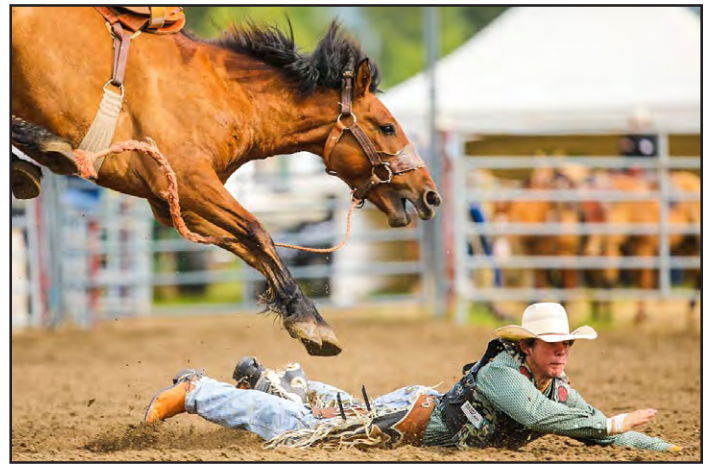
1st Place Okotoks Western Wheel INCOMING