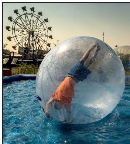
3rd Place St Albert Gazette A Ball Of A Good Time