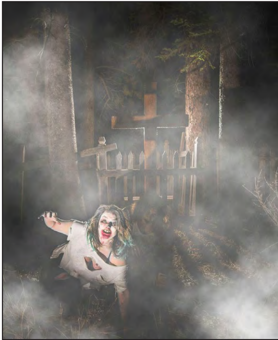
1st Place Rocky Mountain Outlook Walking Dead