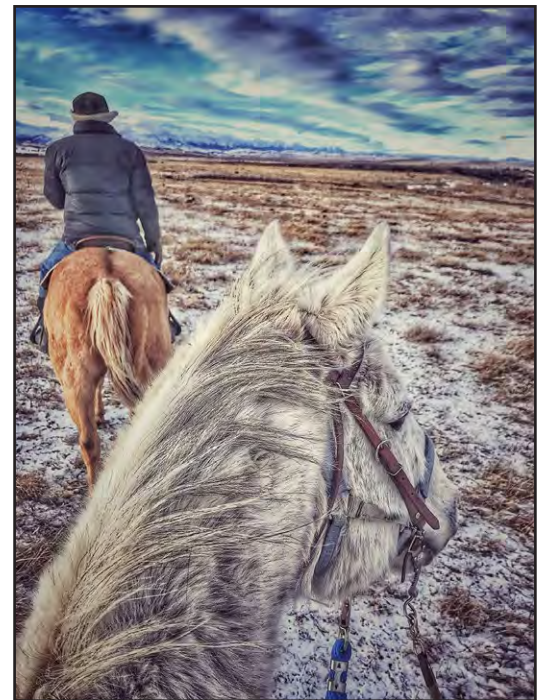
2nd Place Shootin' the Breeze Where you lead Credits: Shannon Robison